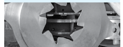
Cutting plate to chop fibre down