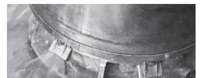
Hydraulic barrier to keep fibre out