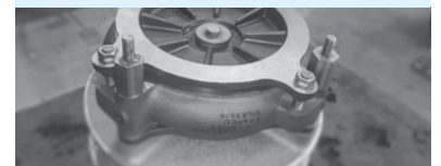
Metal wet end for longer pump life